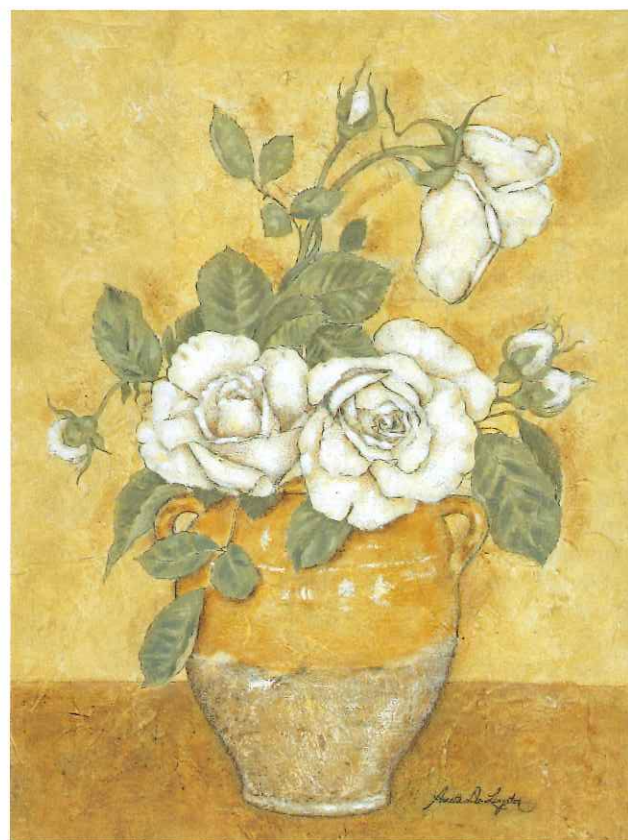
GOLD, 24 x 18 in.

struck by the works from Ancient Peru. The discipline, creativity and spirituality of the Mayas inspired her.