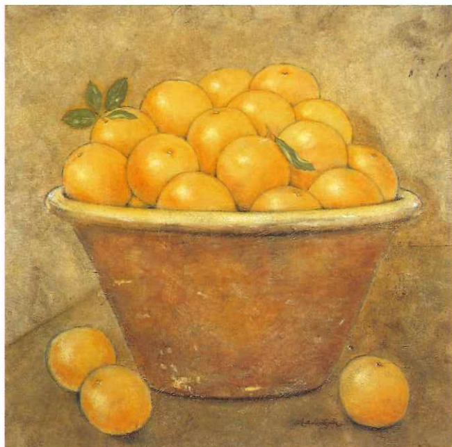
THE RADIANT ORANGE, 36 x 36 in.