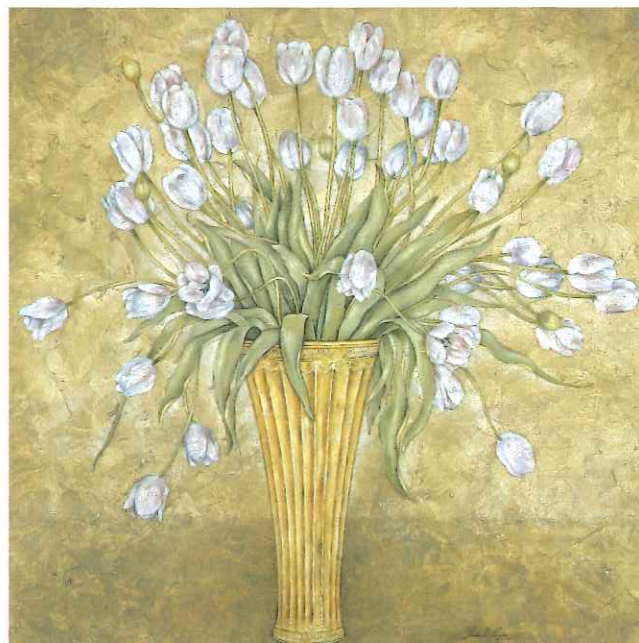
ALL IN GOLD, 48 x 48 in.