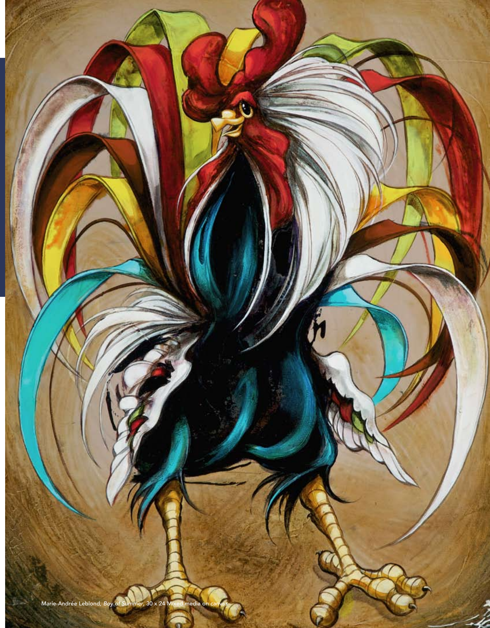
Marie-Andrée Leblond, Boy of Summer , 30 x 24 Mixed media on canvas