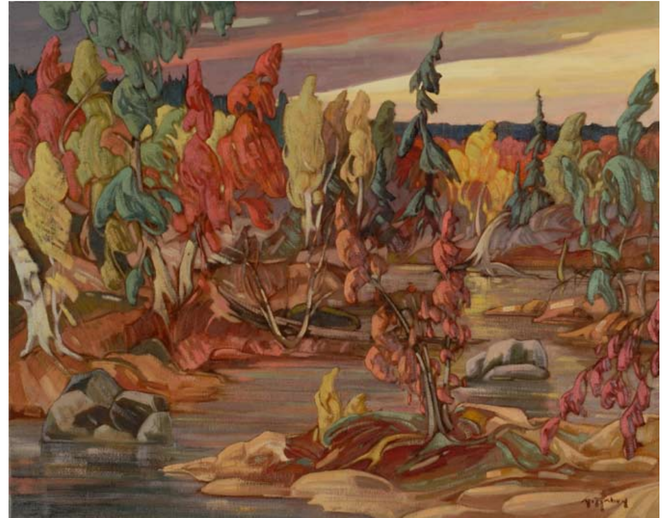
Gaston Rebry, Au coeur de l'action , 24 x 30 Oil on canvas

dozens of Quebec artists. One third of those artists were discovered by Bonnitta and have become legends in Quebec art.