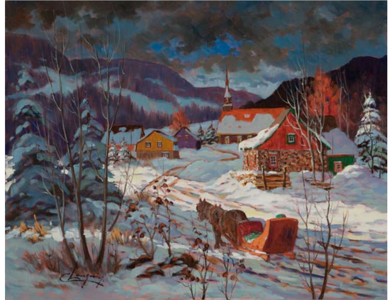
Claude Langevin, Percée de lumière , 24 x 30 Oil on canvas

great painting to share with the next generation to own the painting.