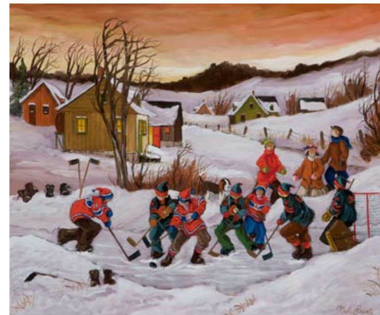
Nicole Laporte, Rang 4 -vs- rang 7 , 20 x 24 Oil on canvas

The gallery's primary product is original paintings and sculptures, but it also carries limited edition prints, greeting cards, art books