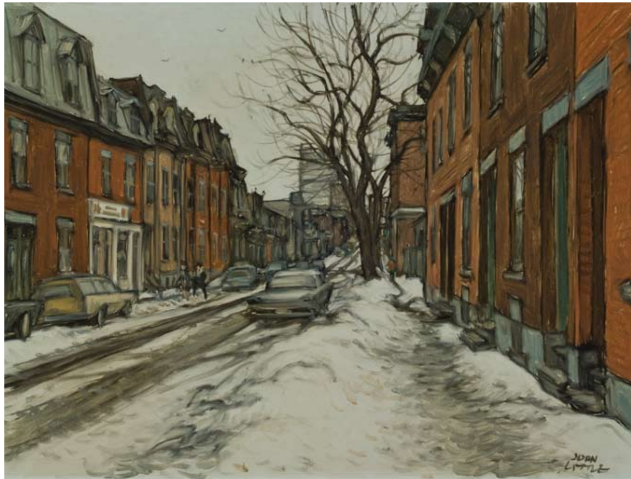
John Little, Rue St-Christophe , 12 x 16 Oil on Canvas

and magazines, high-end vases and glasswork, easels and much more. Personalized services include custom framing, evaluations, restoration, advice and gift registry.