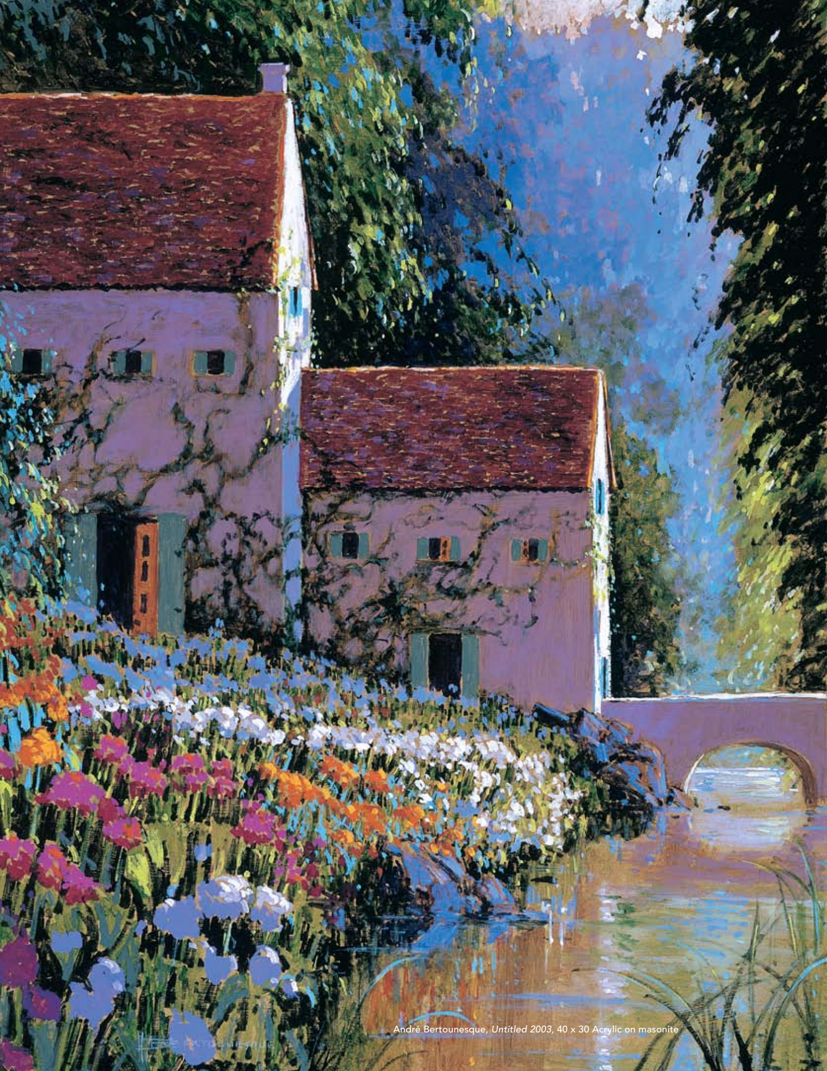
André Bertounesque, Untitled 2003, 40 x 30 Acrylic on masonite