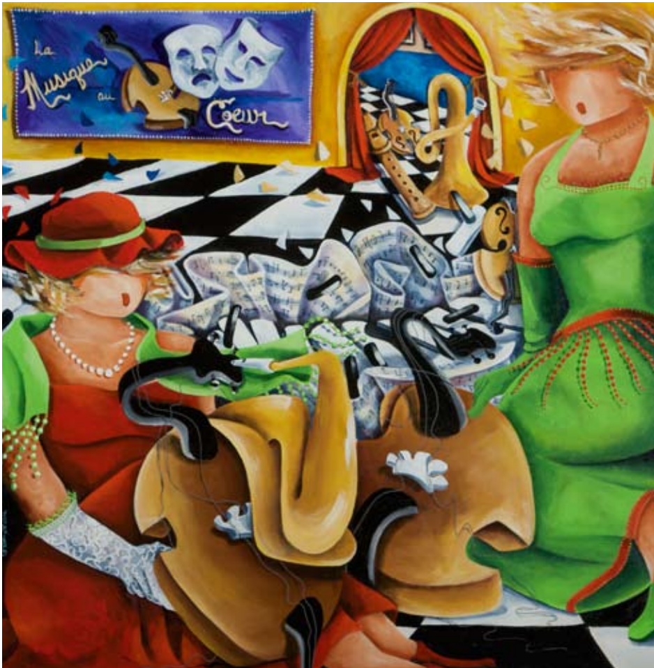
Marc Galipeau, La musique au Coeur , 30 x 30 Acrylic on canvas