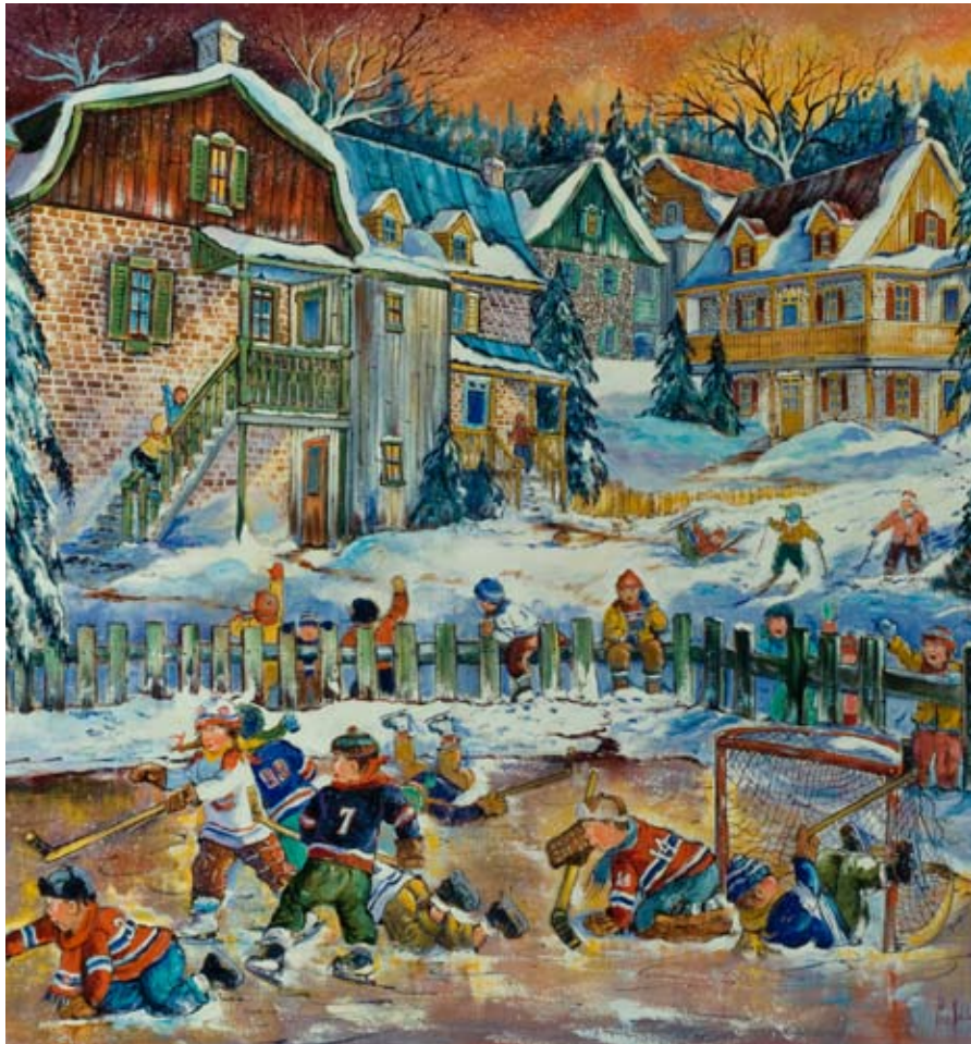
Lise Labbé, Les enfants du village , 36 x 36 Oil on canvas