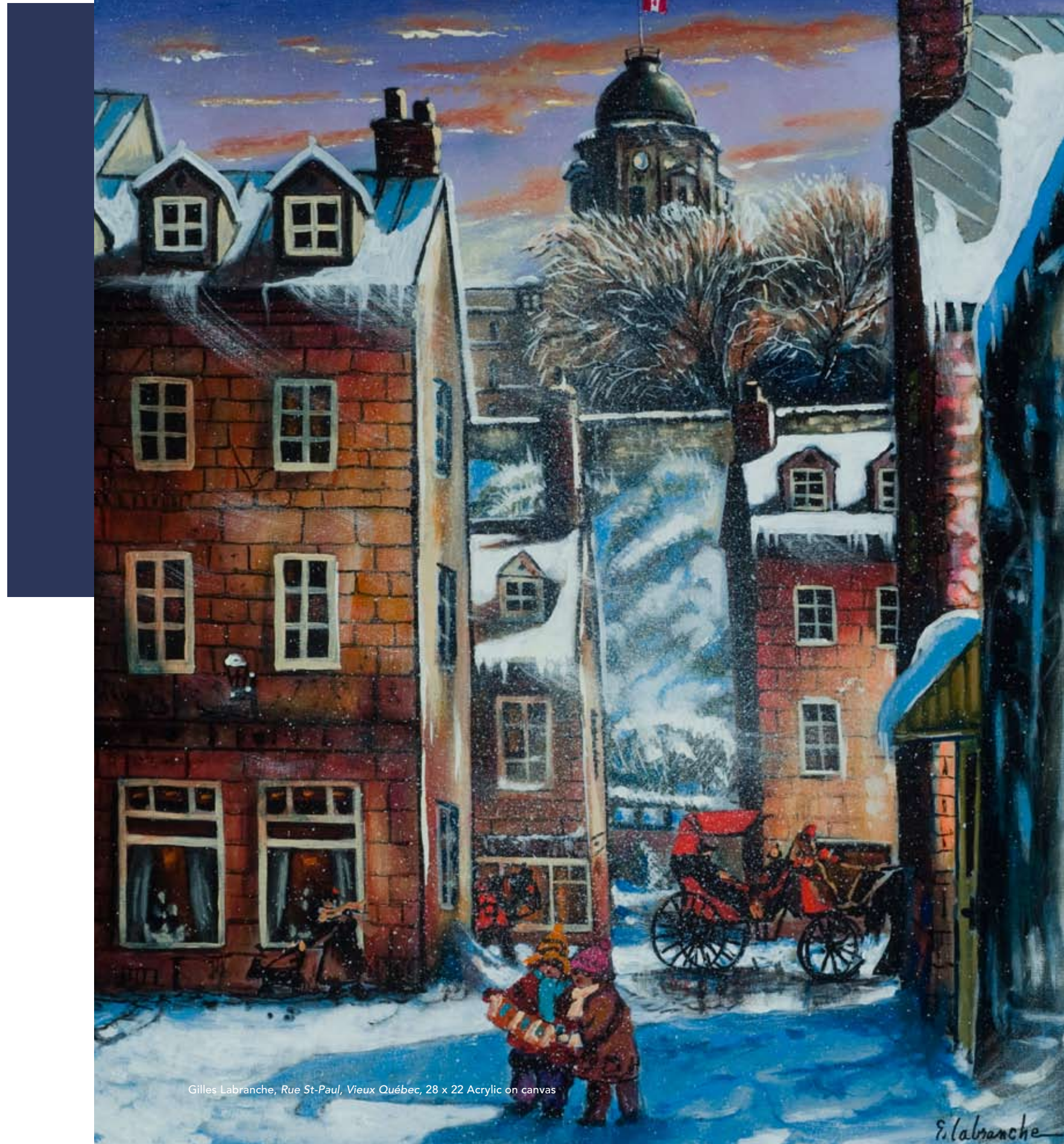
Gilles Labranche, Rue St-Paul, Vieux Québec , 28 x 22 Acrylic on canvas

You can visit Le Balcon d'art at 650, rue Notre-Dame, Saint-Lambert, Quebec, Canada or telephone 450.466.8920 or go to www.balcondart.com .