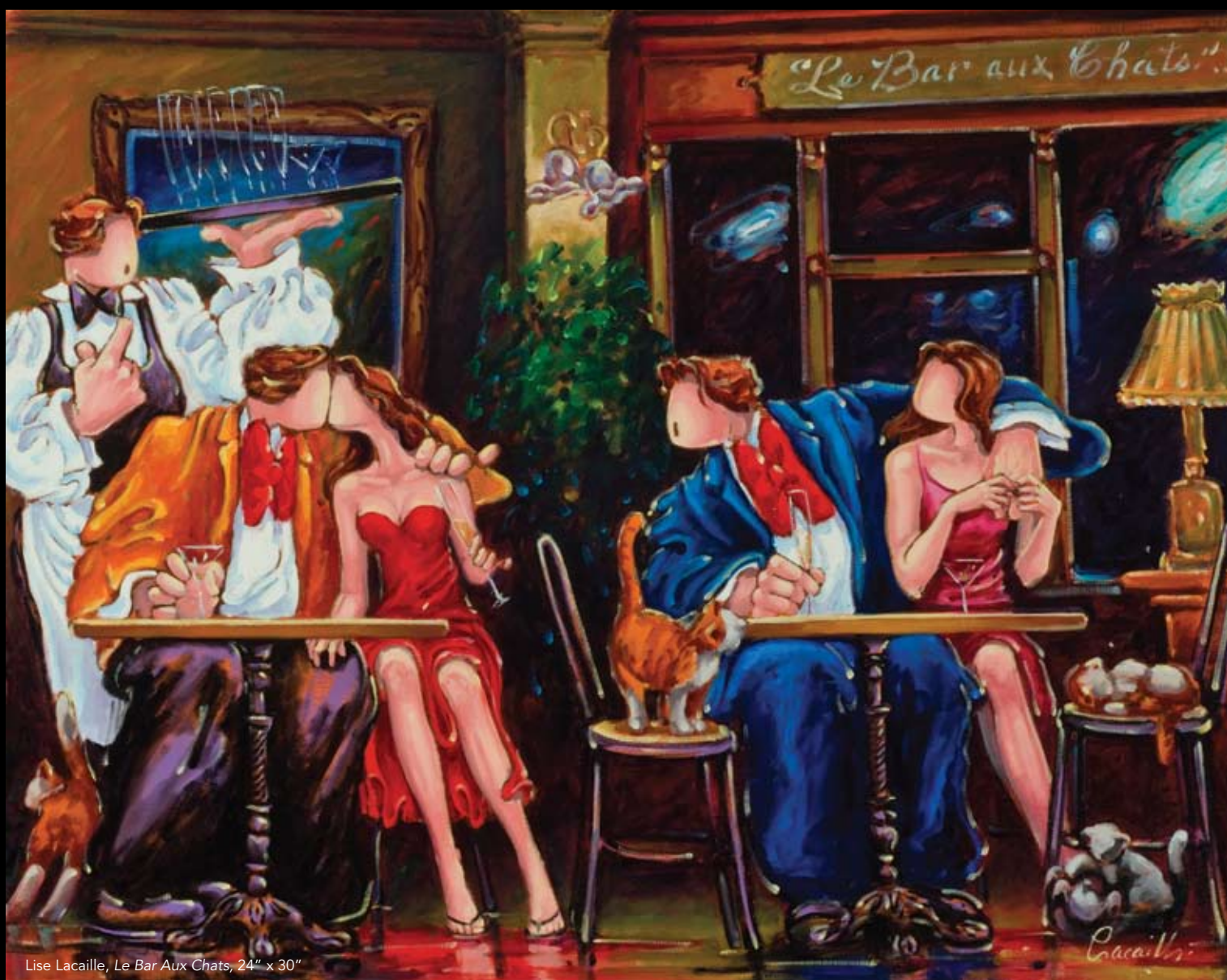
Lise Lacaille, Le Bar Aux Chats , 24" x 30"