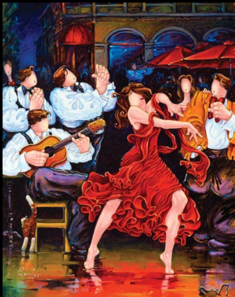
Lise Lacaille, Dancing in the Streets , 48" x 36"

Her paintings are populated by couples living in obvious harmony and with true equality between the sexes. Faces remain blank and the body dominates the scenes. The artist has successfully captured the human body in all its movement and so her figures seem to come to life on the canvas; they speak to us. Hand movements and the rustle of clothing are accentuated by the round shapes. The lines are generous. And the point of view is