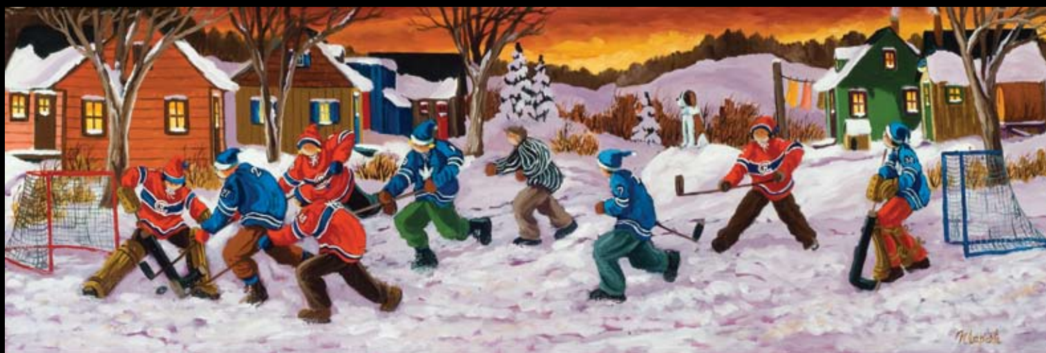
Nicole Laporte, Les Éliminatoires , 12" x 36"