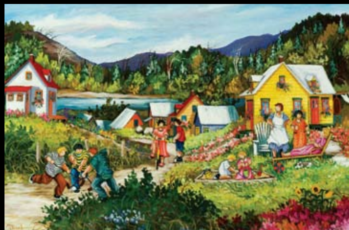
Lise Labbé, Ça, C'Est Une Belle Journée! , 20" x 24"

Nicole paints people of all ages, enjoying life in every season. There is a genuine sense of community or village in her work and everyone is having a great time. Family dogs race after cross country skiers; women watch the activities, while catching up on the neighbourhood happenings; people pass on the street and share a conversation; children play hockey or roast marshmallows over the campfire. Each painting portrays individuals in all different times of life – children, teenagers, young adults, senior citizens – but the common thread is the sense of love, life and laughter that spills off the colourful canvas paintings and into your heart and soul.