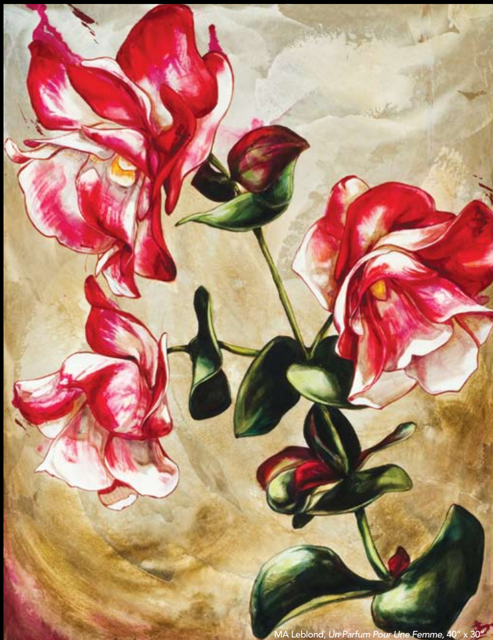
MA Leblond, Un Parfum Pour Une Femme , 40" x 30"