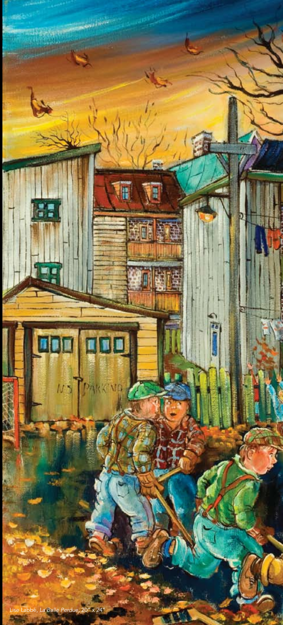
Lise Labbé, La Balle Perdue , 20" x 24"

These are happy paintings – full of life, love and laughter.