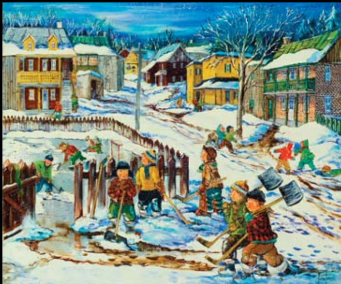
Lise Labbé, L'Esprit D'Équipe , 20" x 24"