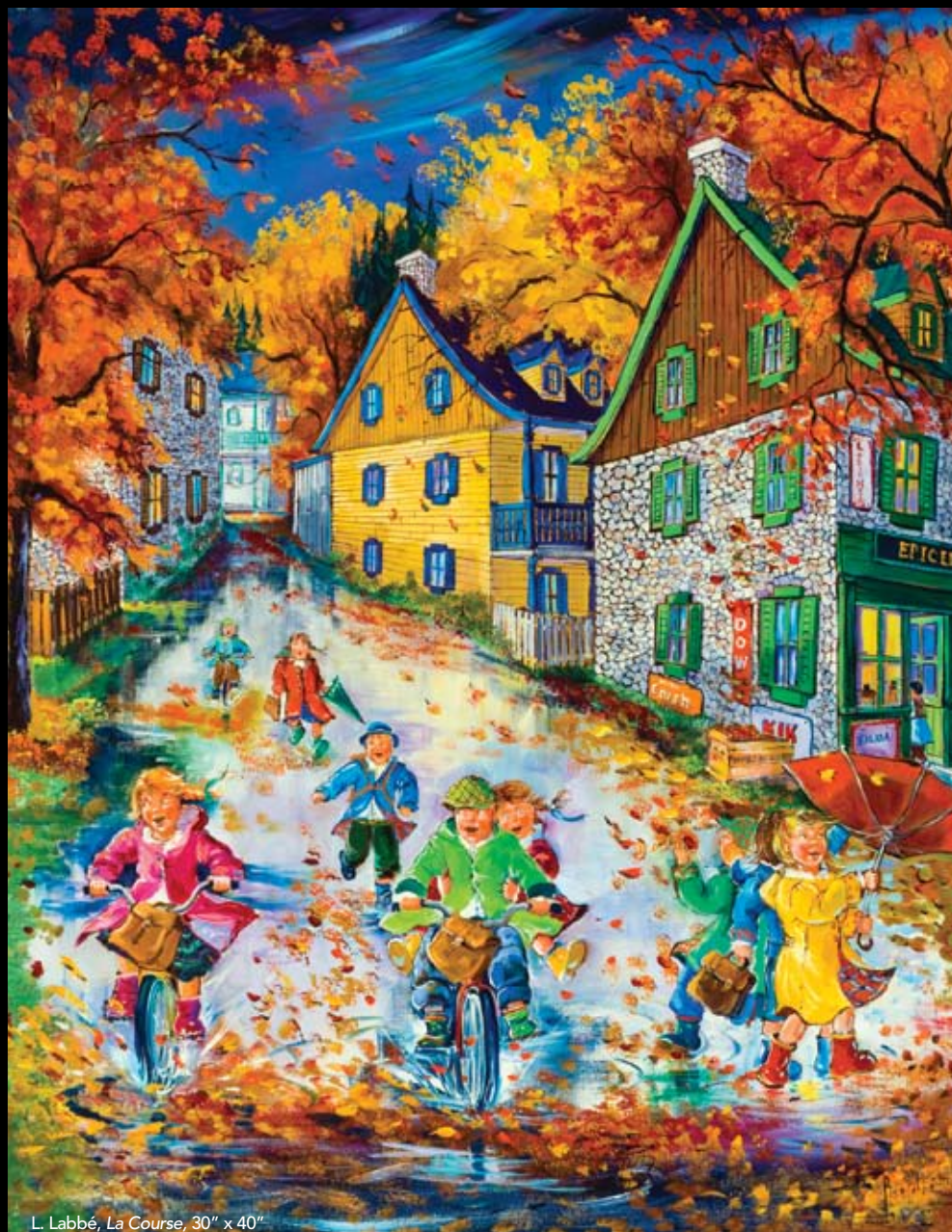
L. Labbé, La Course , 30\"/>