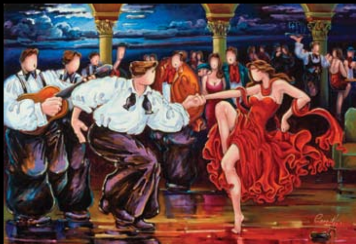
Lise Lacaille, La Salsa , 24" x 36"