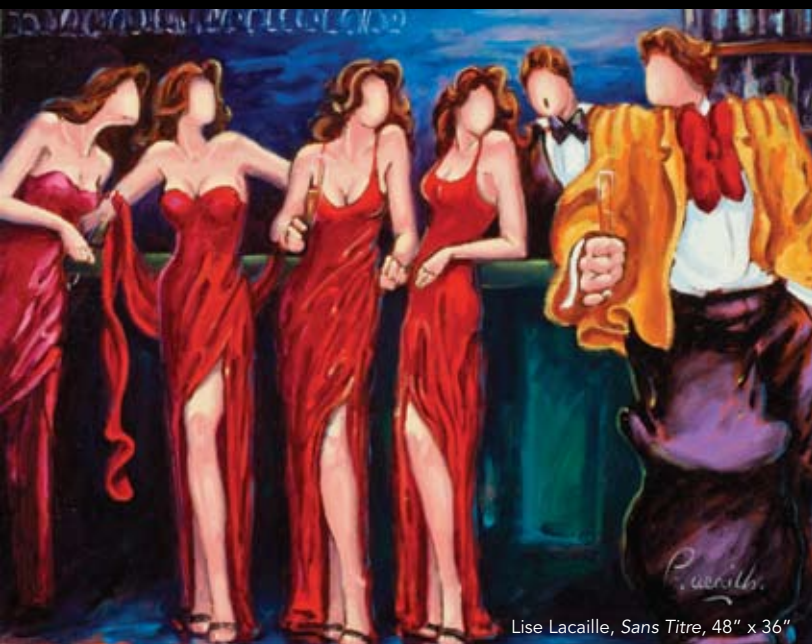
Lise Lacaille, Sans Titre , 48" x 36"