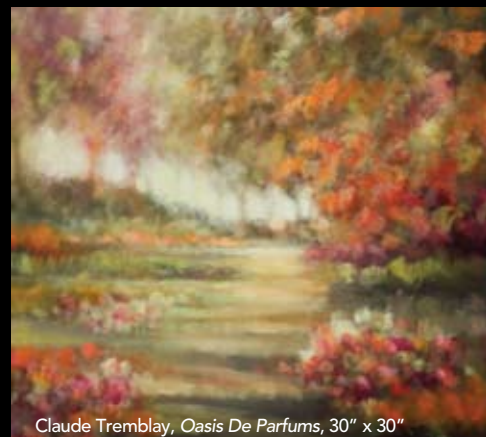
Claude Tremblay, Oasis De Parfums , 30" x 30"