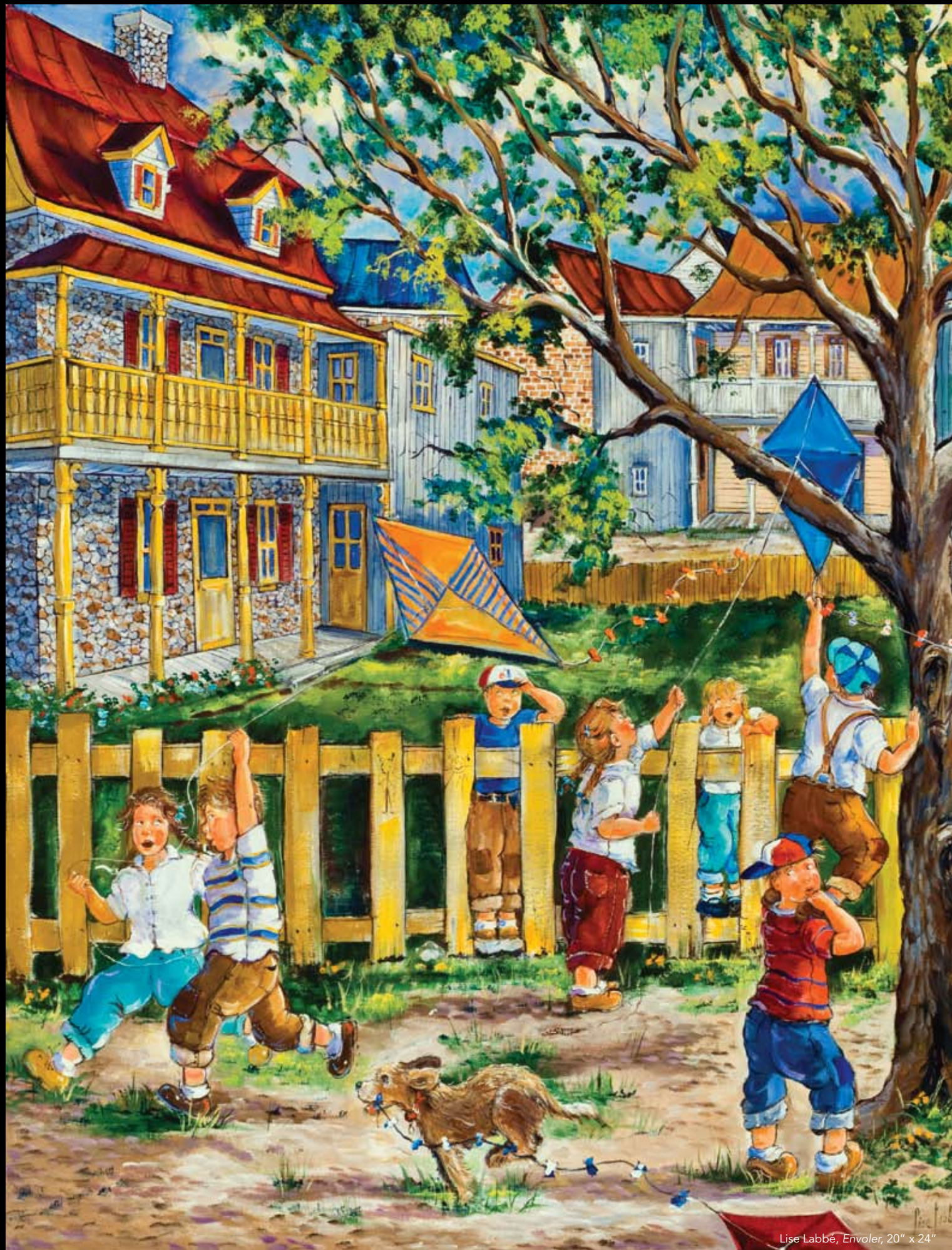
Lise Labbé, Envoler, 20" x 24"