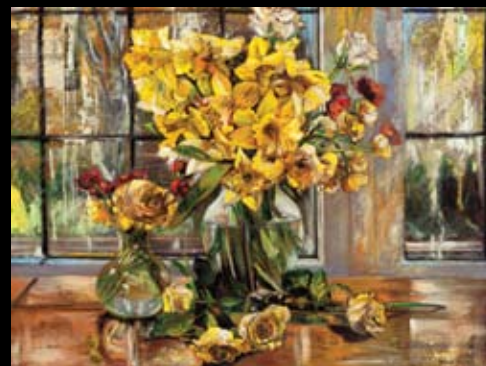
Lynda Schneider Granatstein, Daffodils Sunroom , 36" x 48"