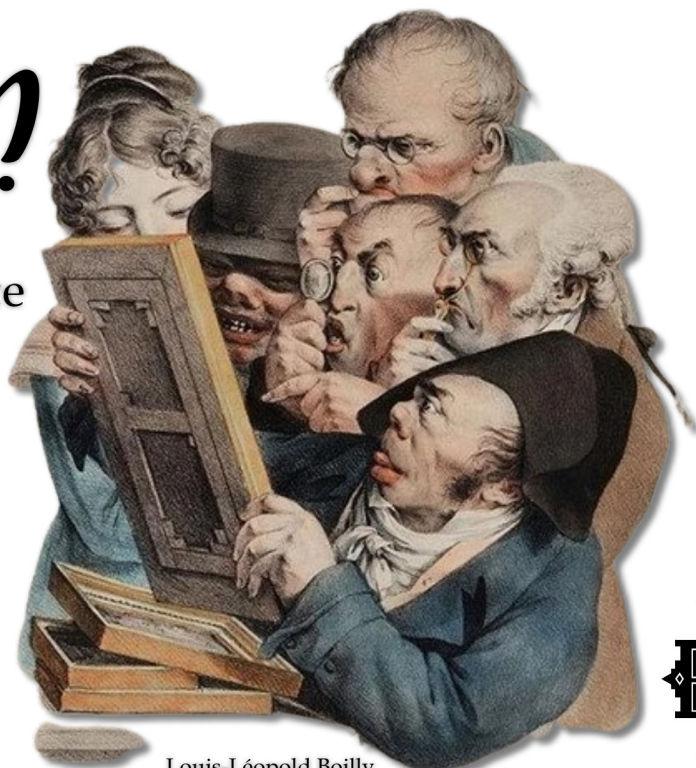
Louis-Léopold Boilly Les amateurs de tableaux (The Picture Enthusiasts), 1823

Contact us and leave the appraisal to the