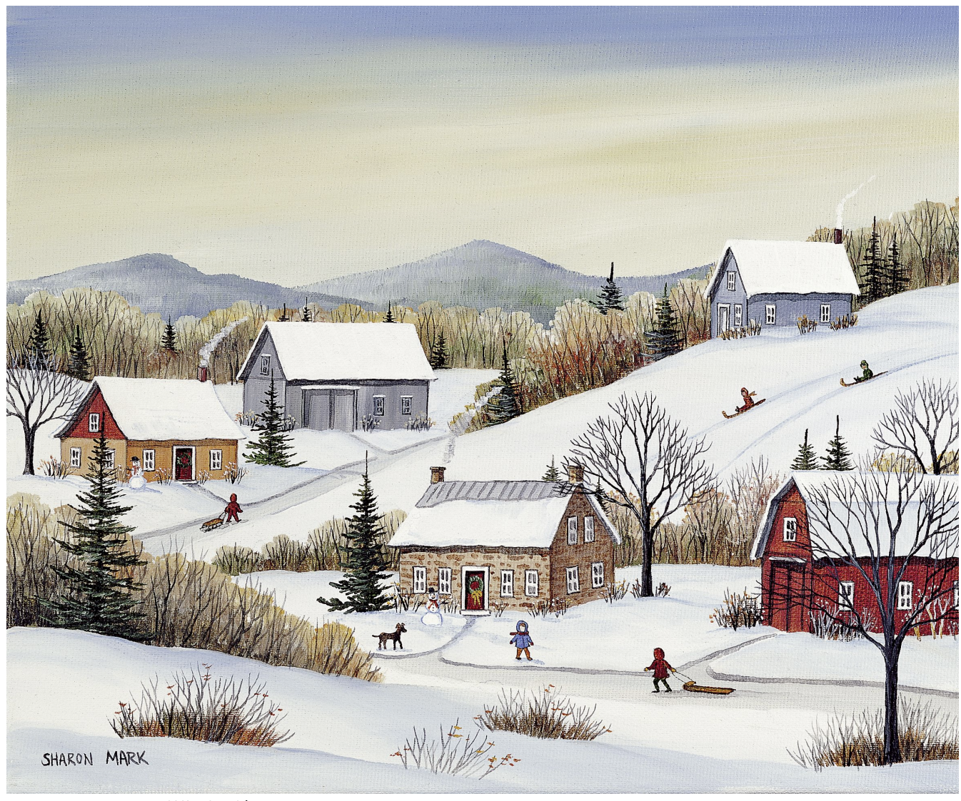
« A GOOD DAY FOR SLIDING », 2007, 10 x 12 in.