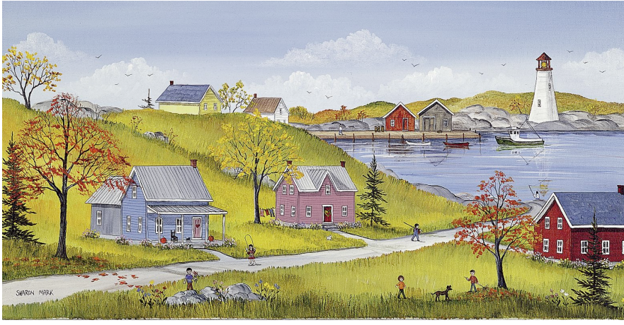
« AUTUMN BY THE LIGHT HOUSE », 2006, 12 \times 24 po.

ous sizes, and most of her work finds eager buyers.