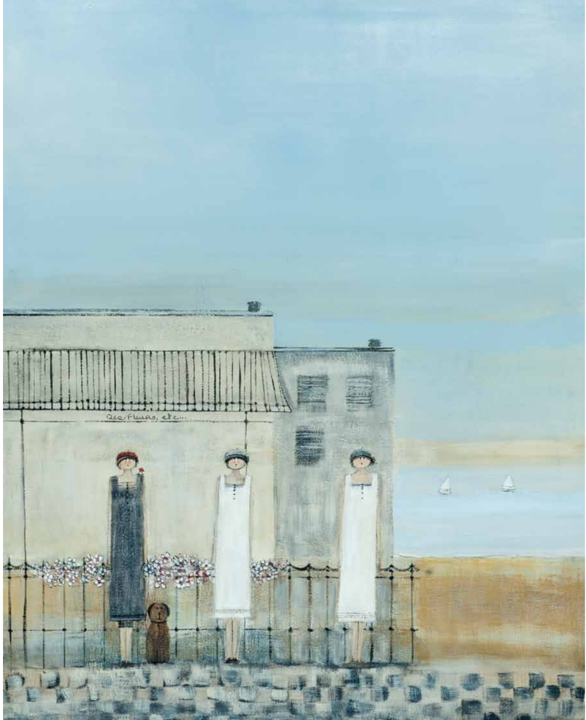
left, Trois Voiles , acrylic on canvas, 18" x 14" above, Des Fleurs , acrylic on canvas, 30" x 24"