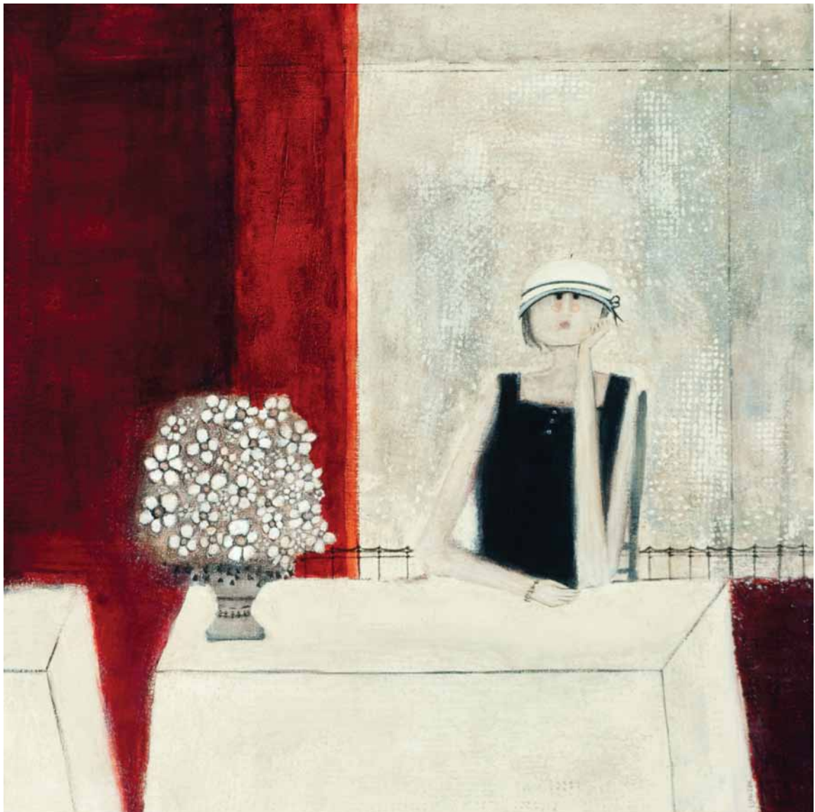
left, Le Feuille d'Or , acrylic on canvas, 20" x 20"