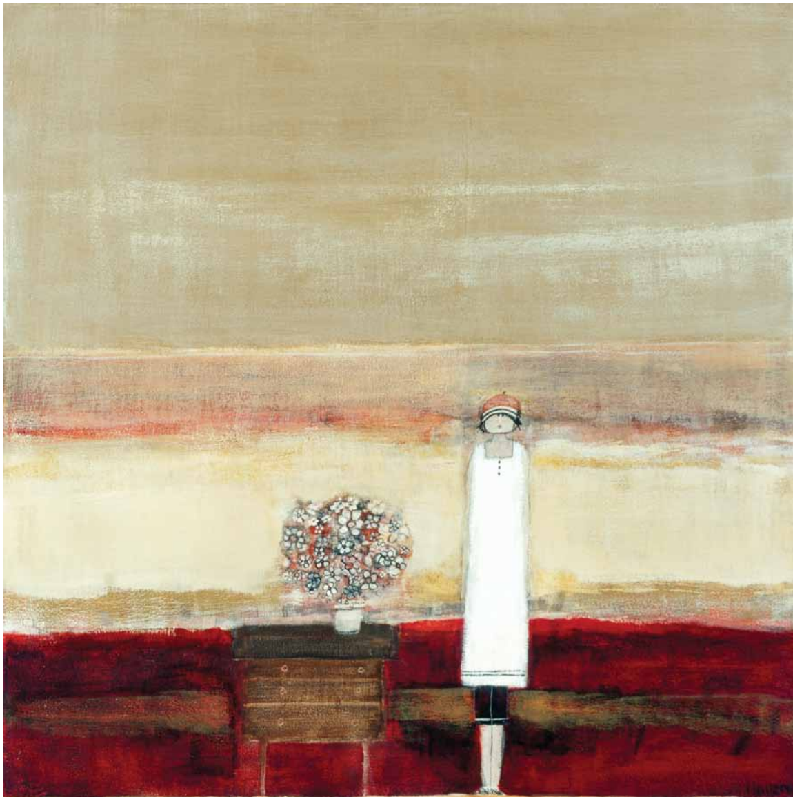
previous spread left, Toi et Moi , acrylic on canvas, 16" x 16"