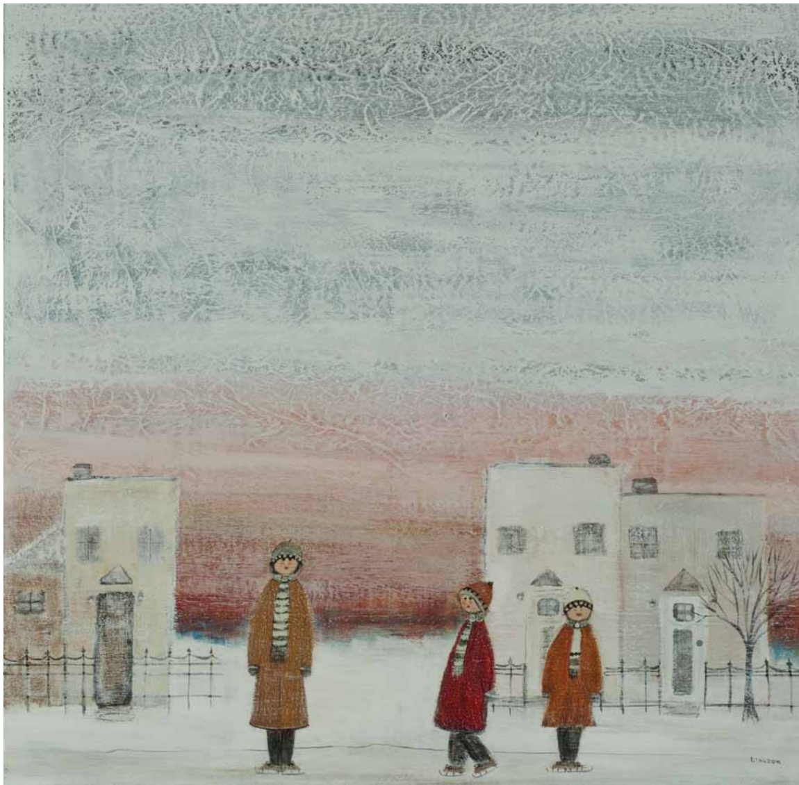
previous spread left, Decembre , acrylic on canvas, 20" x 16" previous spread right, Le Robe Rouge , acrylic on canvas, 24" x 12"