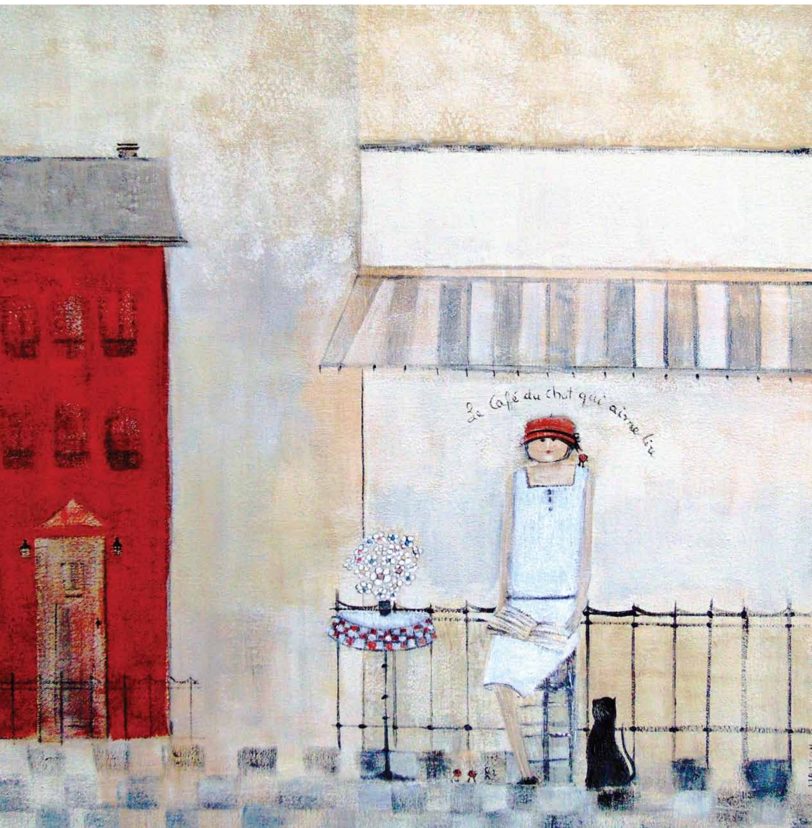
above, Le Café du chat qui aime lire , acrylic on canvas, 20" x 20" right, La Maison Bleue , acrylic on canvas, 20" x 20"