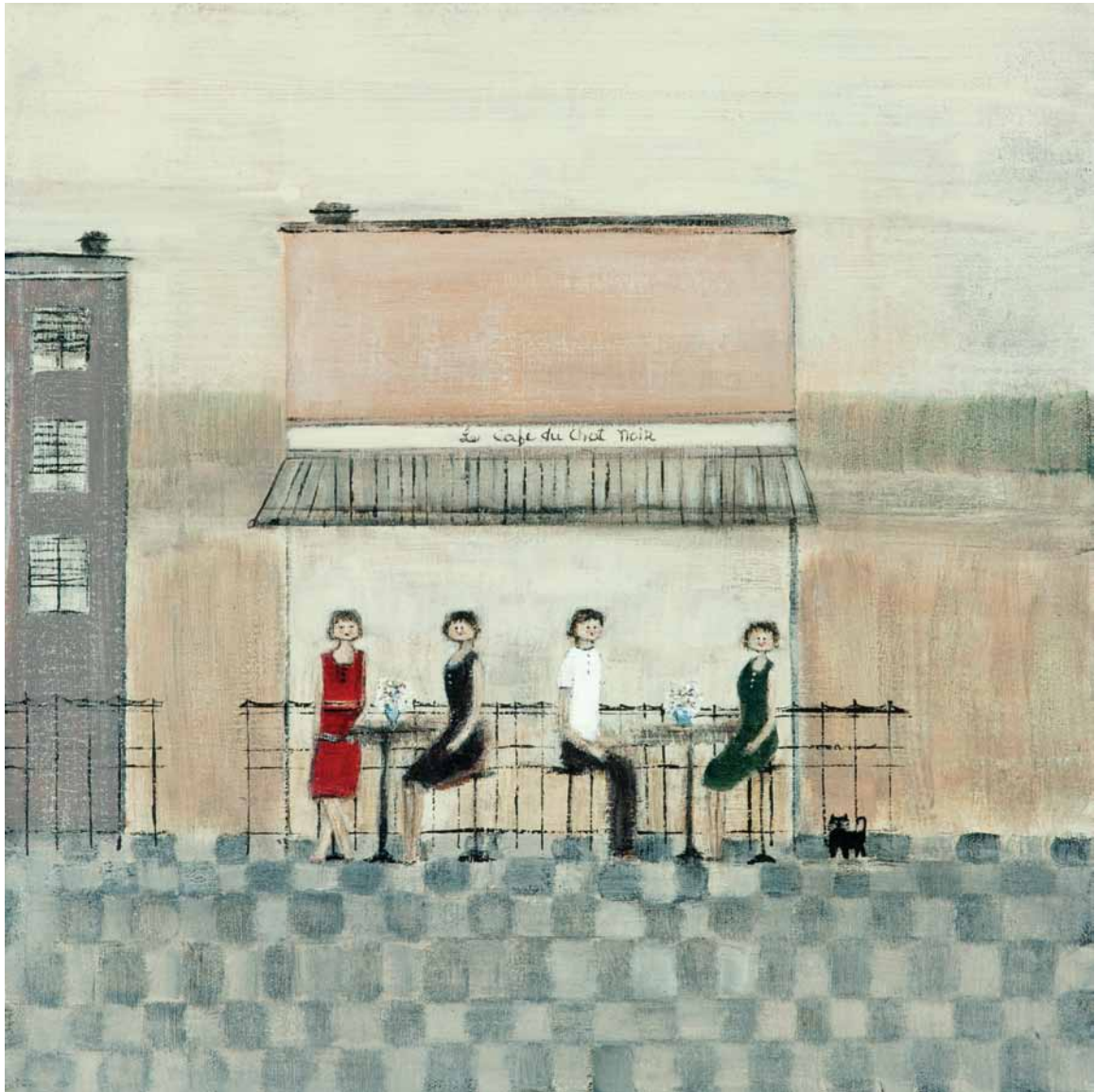
previous spread, Le Faubourg Saint-Honore , acrylic on canvas, 11" x 14" left, Nu Pieds , acrylic on canvas, 10" x 8"