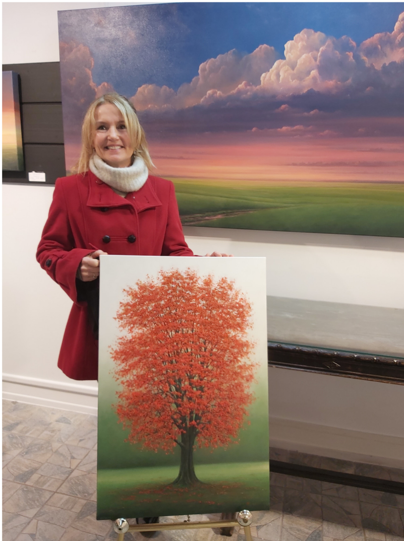
Gail Descoeurs Ablaze Acrylic, 30x20