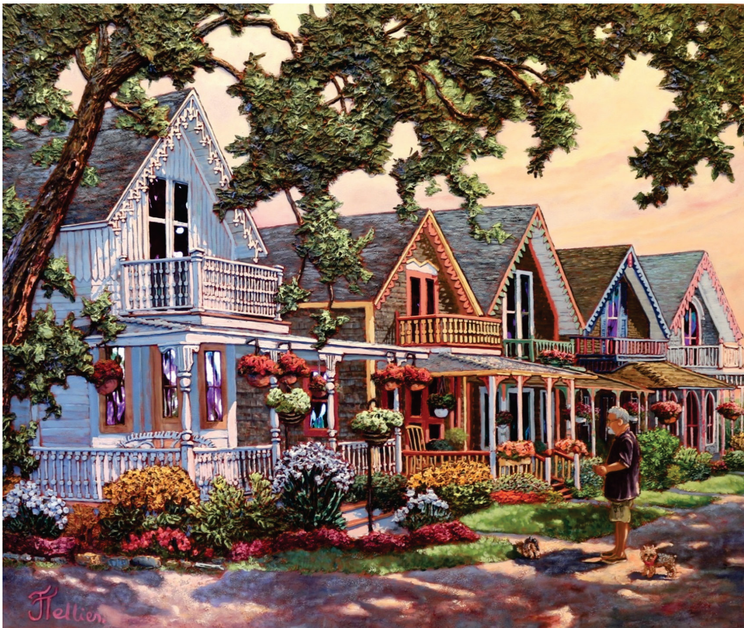
This Page, above, Matinée à Oak Bluffs , 3D on wood + glass + acrylic, 30" x 36"