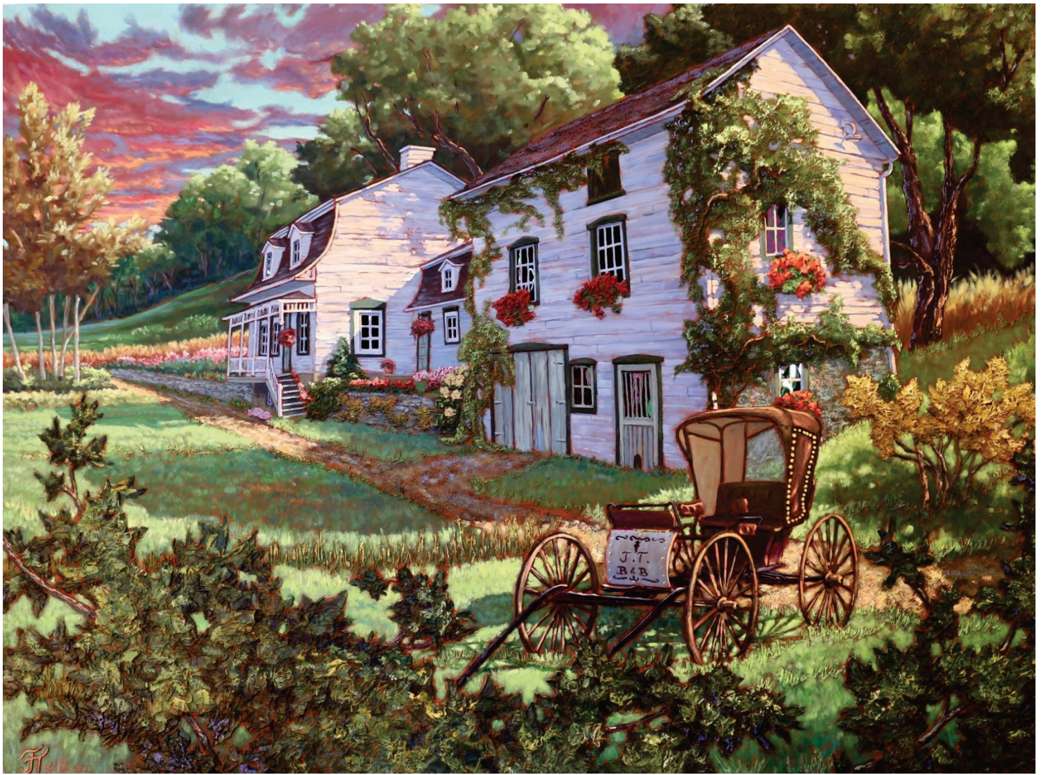
This Page, above, Sise au pied de la pente , 3D on wood + glass + acrylic, 36" x 48"