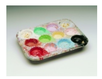
The artist's palette (muffin tin). Musée de la pulperie collection.