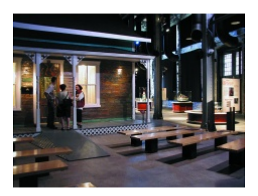
Arthur Villeneuve's home inside the museum in 2002.

Has <u>Arthur-Villeneuve's House</u>, uprooted from its original street and neighbourhood, been taken into a sort of captivity? Does it still have the same artistic impact in its current preserved, yet artificial state, a state that might very well be the