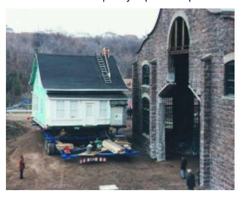
Villeneuve's home being moved in November 1994.

Since Arthur Villeneuve's home was a heritage asset and a painted work of art, it naturally became a sort of museum-within-a-house. Villeneuve and his wife welcomed visitors from 1959 until the artist's death in 1990. At that moment, deprived of its creator, the house became much more difficult to interpret. There were two possible courses of action: turn the house into a permanent museum piece or let it slowly deteriorate. The question of how to preserve the house (which many people saw as being significant only in its original context, environment and location) was not an easy one to answer. A solution nonetheless presented itself: transform Arthur Villeneuve's museum-within-a-house into a house-within-a-museum.