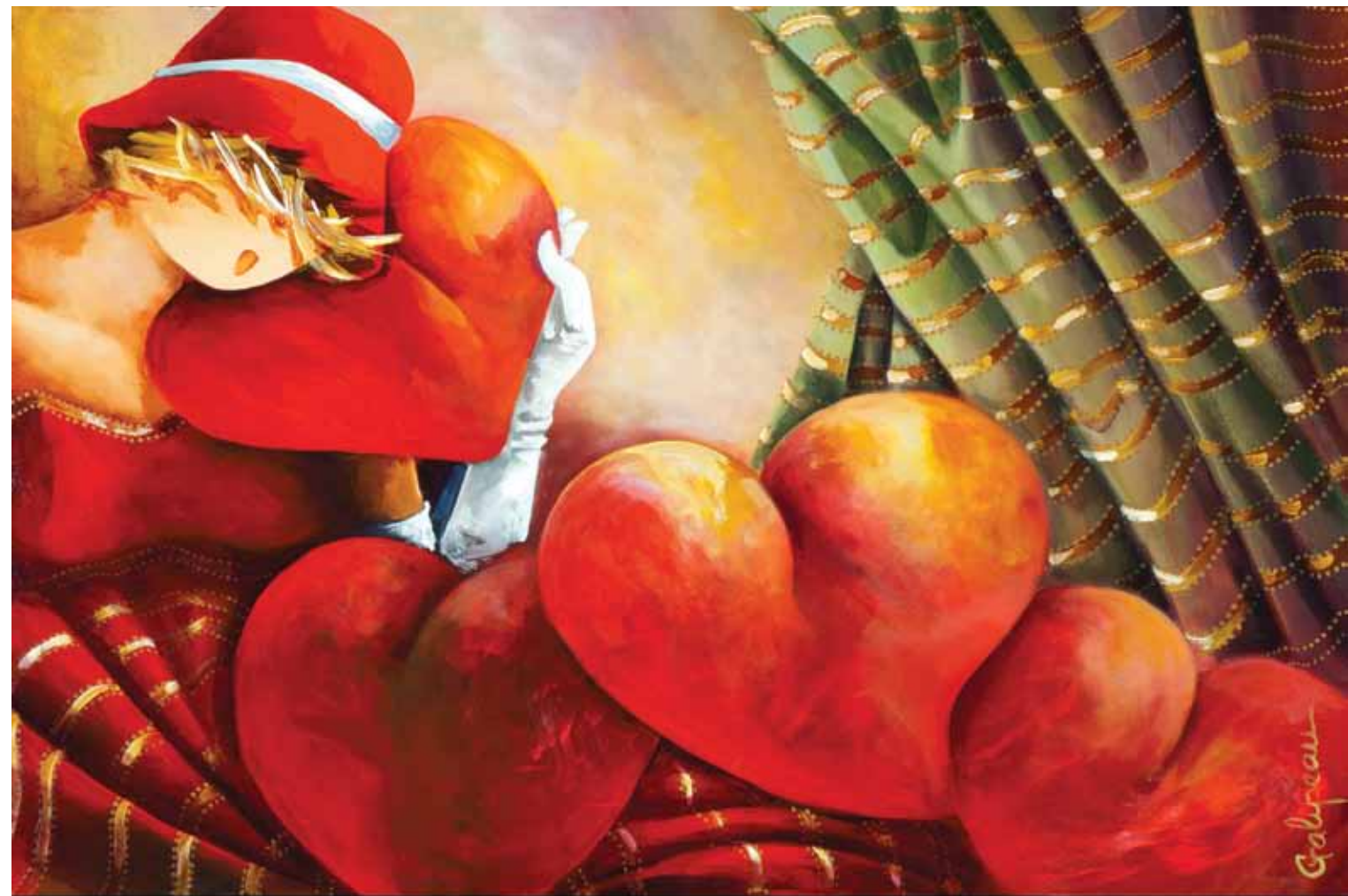
above, Ecouter Son Coeur , acrylic, 24" x 36" left, Le Temps De Te Dire , acrylic, 48" x 24"