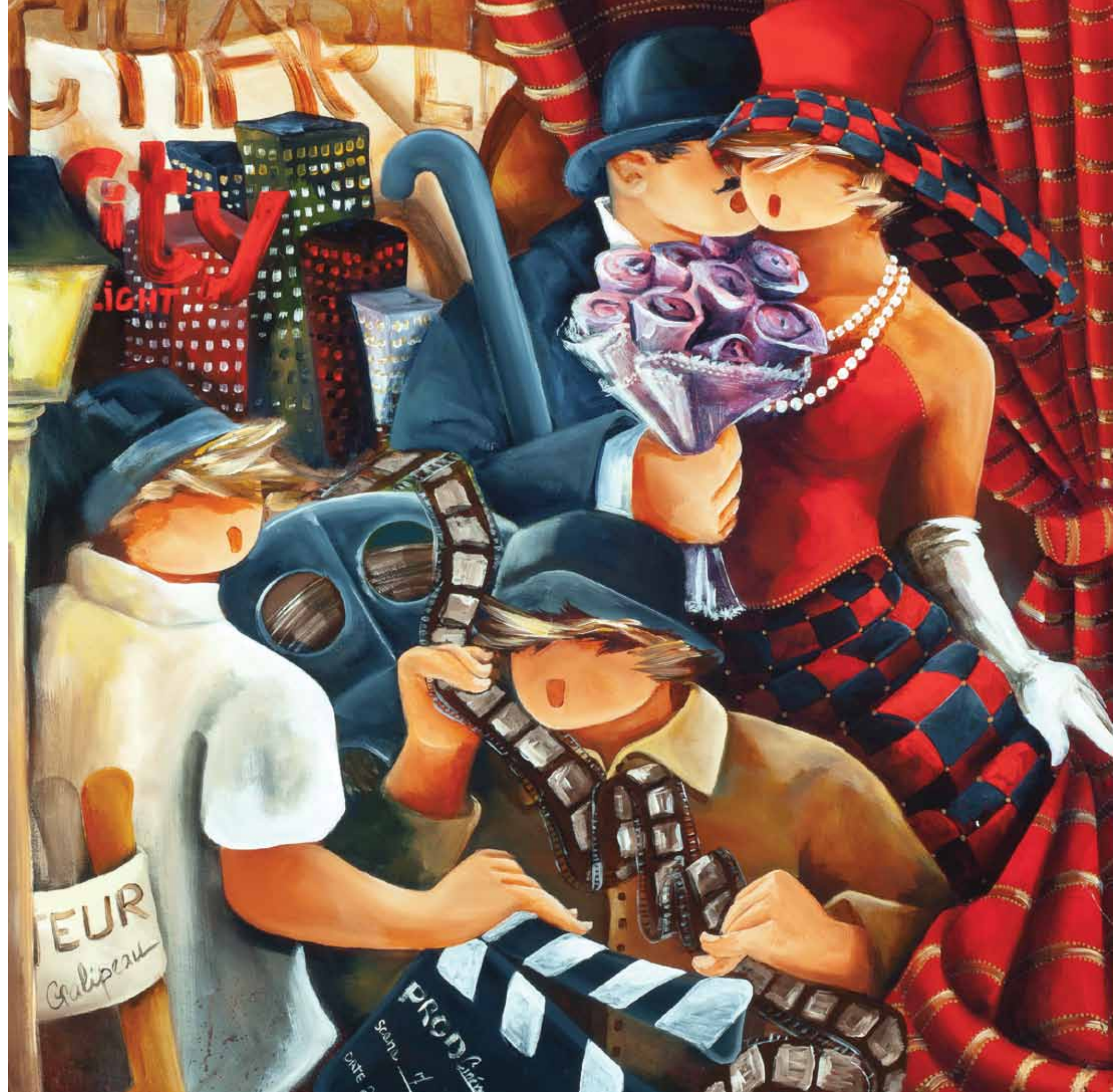
left, La Demesure , acrylic, 36" x 12"