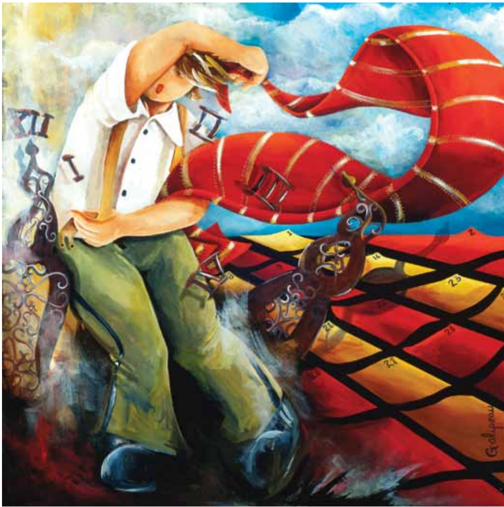
previous page, Ma Lumiere Interieure , acrylic, 24" x 30" above, Jouer Avec Le Temps, Jouer Avec Le Vent , acrylic, 40" x 40" right, Gagner Sur Tous Les Plans , acrylic, 30" x 30"

paint. Suddenly, a dark star-filled sky will jump out at me, or a park bench or the silhouettes of an embracing couple. It might sound mysterious, perhaps even a bit crazy, but a voice inside of me guides me to the end of the painting."