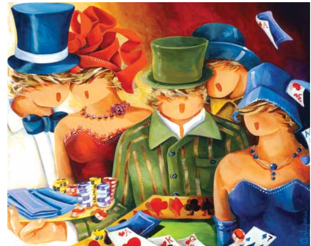
above, A Votre Service , acrylic, 24" x 30" left, Complicite , acrylic, 24" x 24"

immediately," he recalls with a smile, "but after several attempts, Multi Art was seduced by my work and they agreed to show my paintings on a trial basis in order to judge the reaction of their clientele. The very date of my fortieth birthday, Multi Art finally gifted me a permanent position on its team! From that day forward, I have been represented by a dozen significant galleries across Canada!"