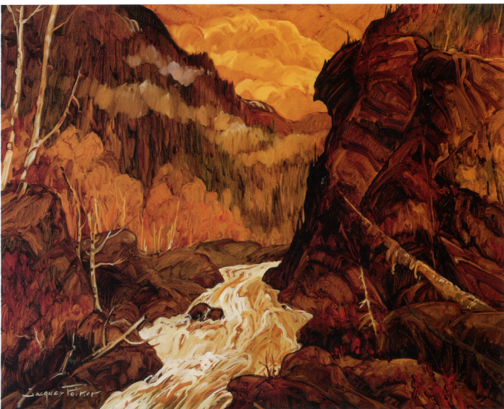
UNE CHUTE D'AUTOMNE/AUTUMN FALL, 2001, 24 x 30 in.