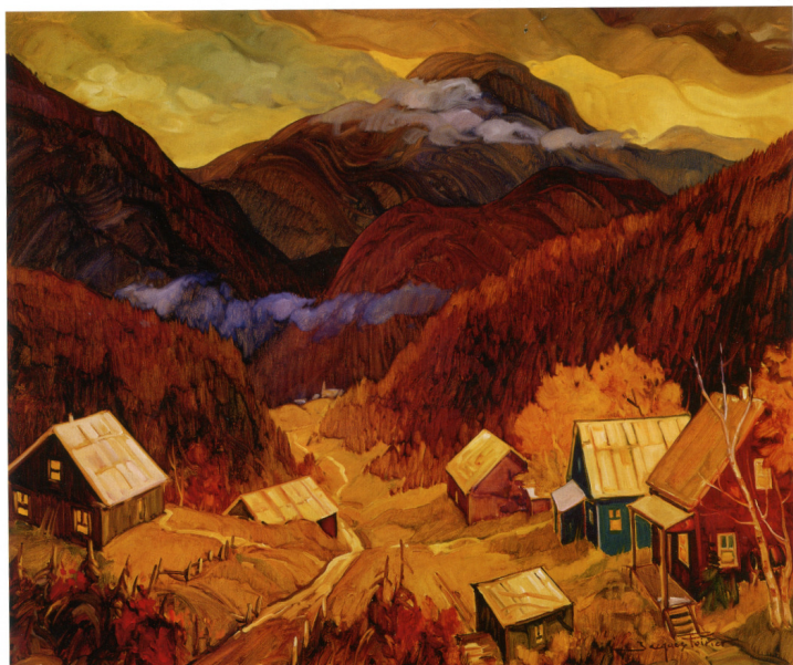
MATIN D'AUTOMNE DANS CHARLEVILLE/AUTUMN MORNING IN CHARLEVILLE, 2001, 30 x 36 in.