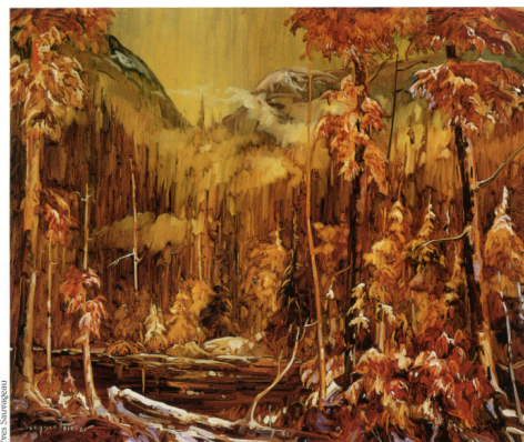
PREMIERE NEIGE, FORÊT LAURENTIENNE/FIRST SNOW, LAURENTIAN FOREST, 2001, 30 x 36 in.