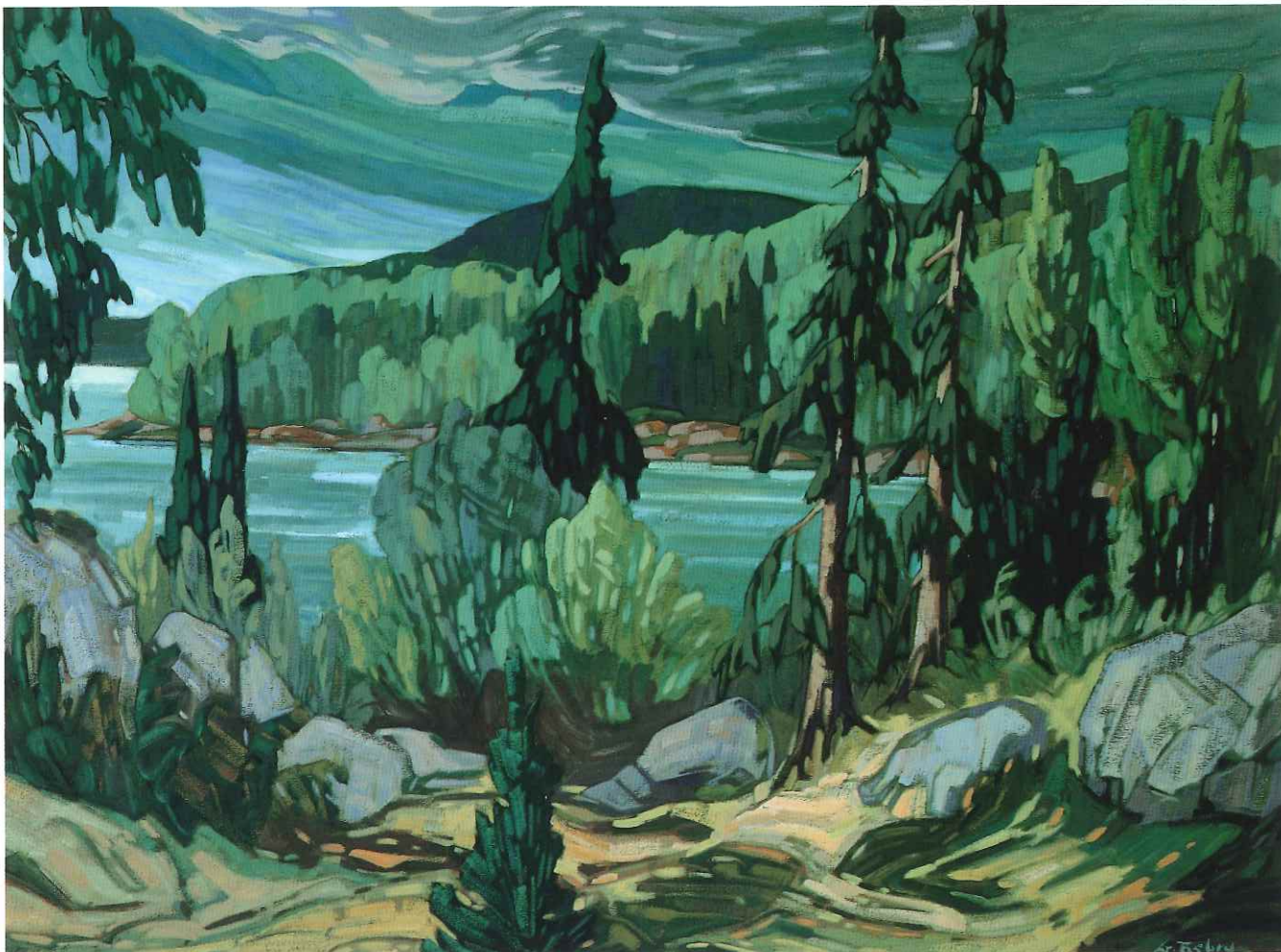
SUMMER SILENCE/SILENCE ESTIVAL, 2000, 40 x 60 in.