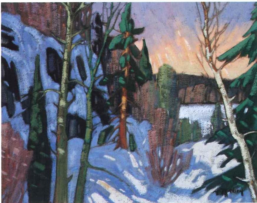
IN THE DEEP OF THE WOODS/AU CREUX DES BOIS, 2001, 12 x 16 in.

in Rebry's style in recent years, with faster brush strokes, and more stylized forms. From memory he can paint landscapes he has seen several days earlier, reworking, adding, completing a scene, preferring fall and winter scenes to summer's uniform greenness.