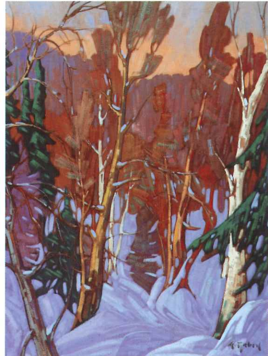
SYMPHONY IN BLUE, 2001, 24 x 20 in.