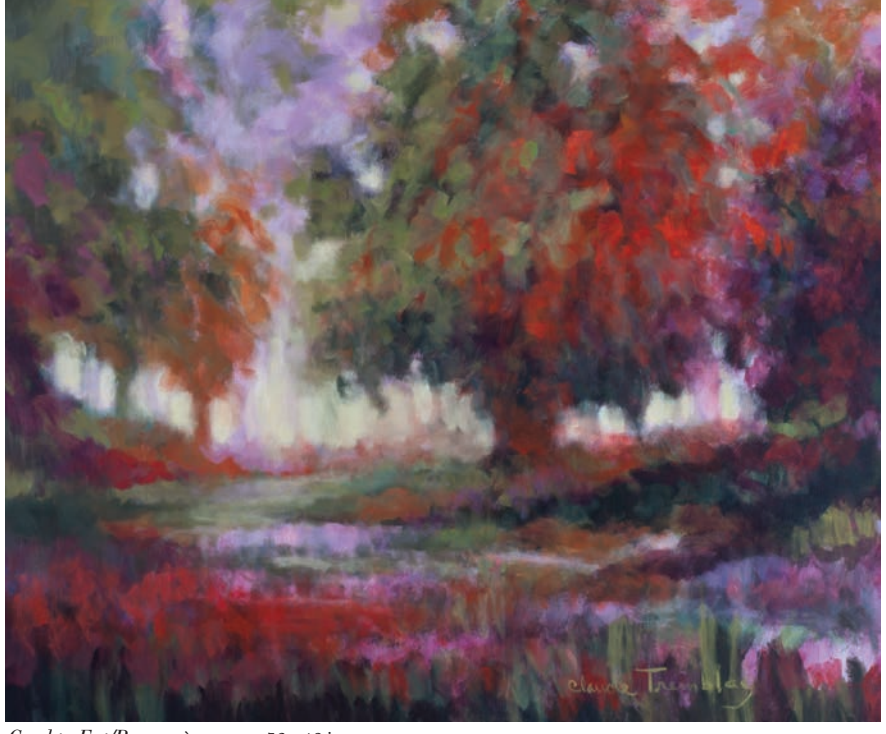
Good to Eat/Bonnes à croquer, 36 \ge 18 in.

Here may lay the reason why every painting begins with a simple horizon line into which she incorporates a pool of light guiding the eye of the spectator towards a sensation of infinity. The artist regards the tree almost as a living character that interplays with the magic of light, with rays of spirituality filtering through towards a more conscientious way of life resting on a set of principles, mostly towards an ecological and equitable way of life which takes responsibility for the good of generations to come.